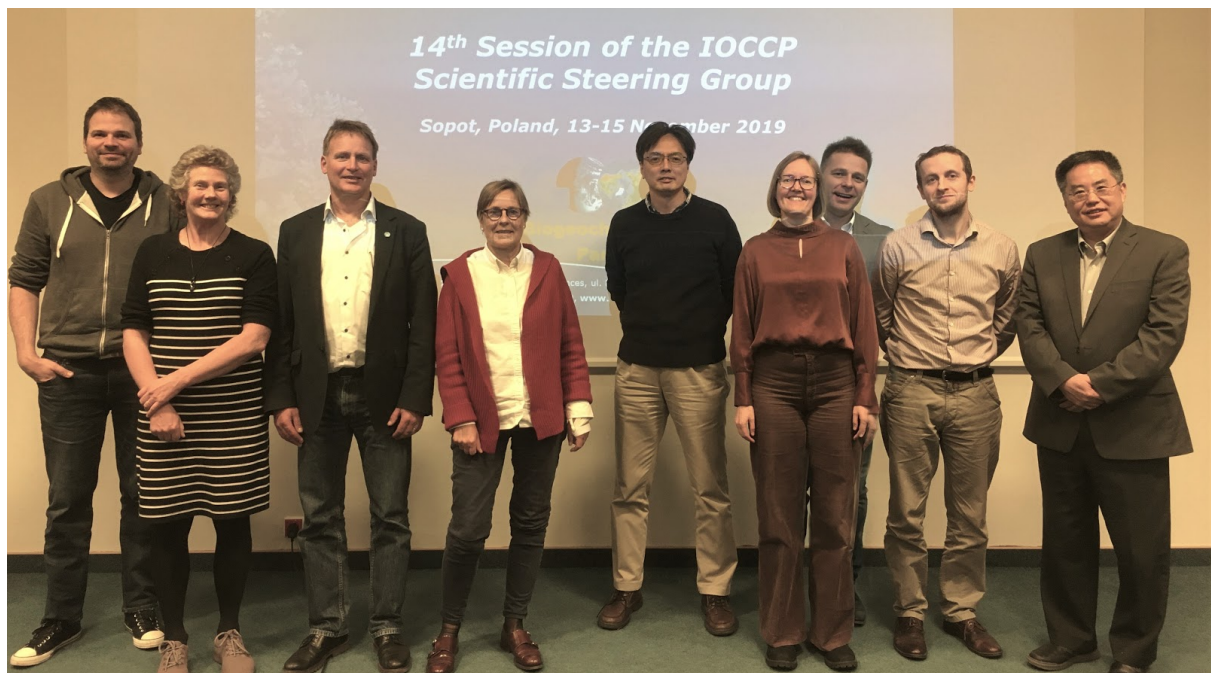
Institute of Oceanology Polish Academy of Sciences (IO PAN), Sopot, Poland, 13-15 November 2019