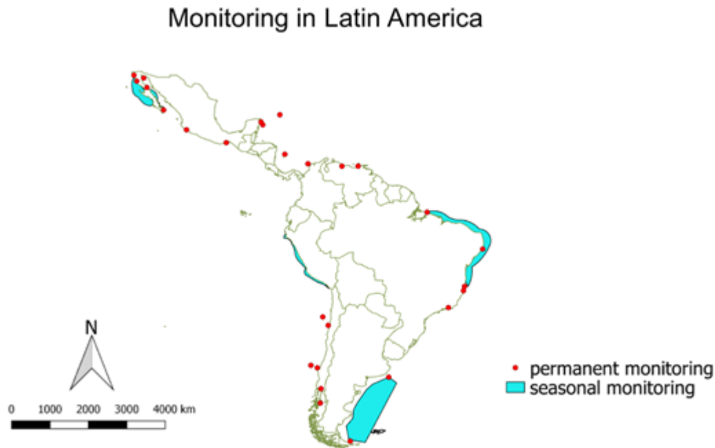
Figure 3. Monitoring of different parameters of the carbonate system at specific locations (red dots, buoys, continuous measures), or covering large coastal and oceanic areas (blue, oceanographic cruises, seasonal).

(Gorgona Island). It seems that most of the instruments are not being deployed yet for different administrative reasons, including those being deployed in the Colombian Pacific (Gorgona Island, Colombia), Galapagos Island (Ecuador), México and Argentina. Deployment of the sensors in Gorgona Island as well as the calibration of equipment in a facility at the Universidad Javeriana, Colombia, will be supported by Cristian Vargas through the GOA-ON Pier2Peer programme.